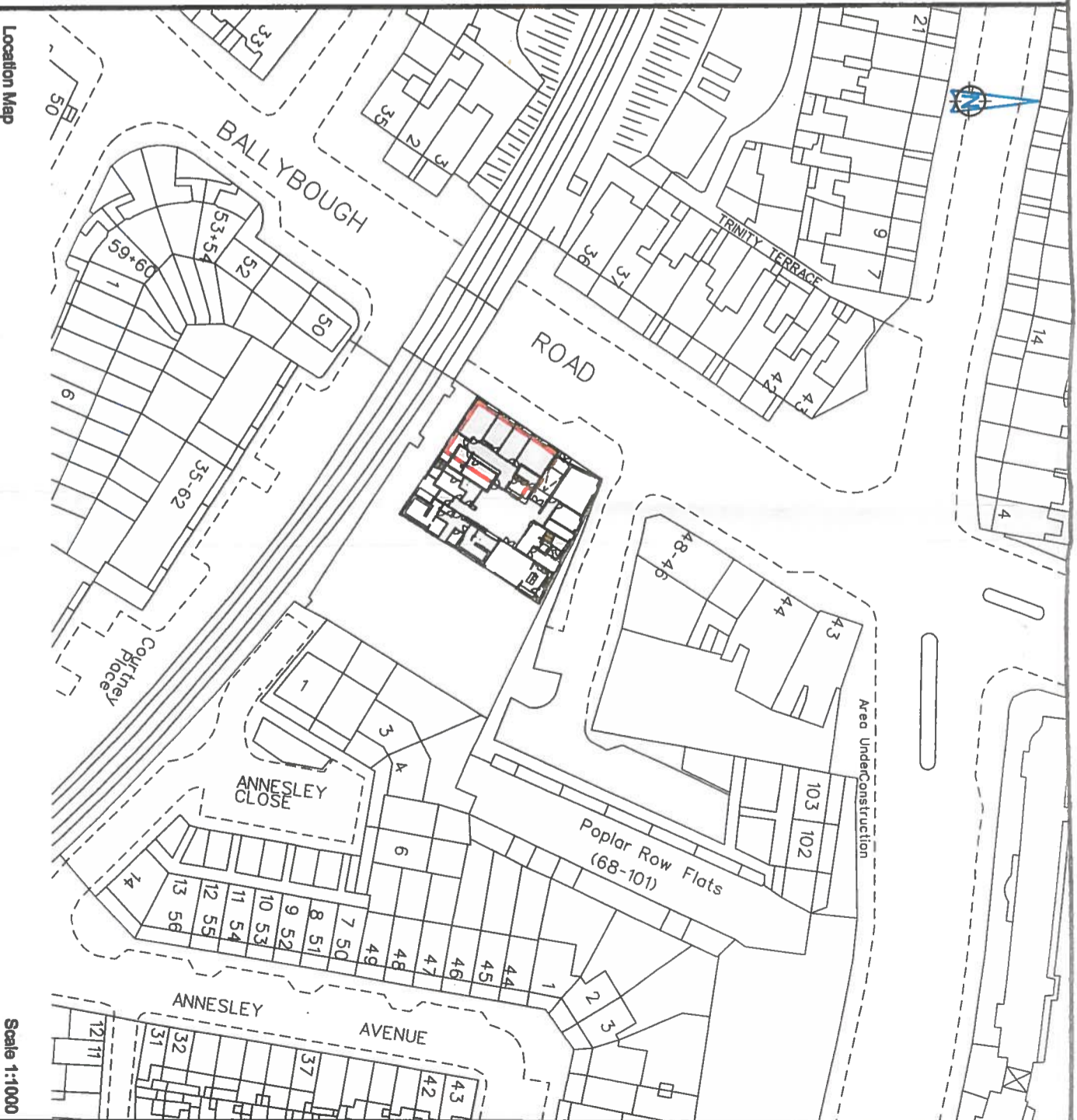
Location Map Scale 1:1000

Ballybough Community Centre Dublin City Council to Larkin Unemployed Centre Limited Grant of Licence