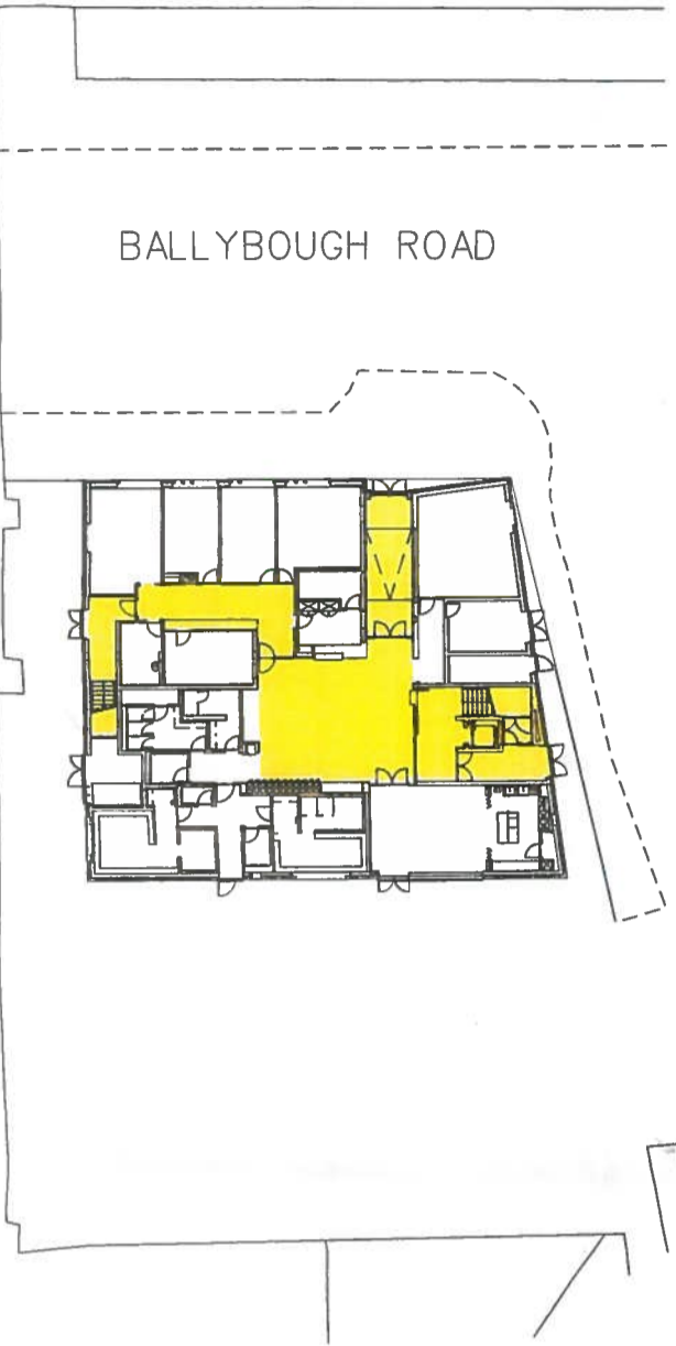
Ground Floor Plan Scale: 1:500